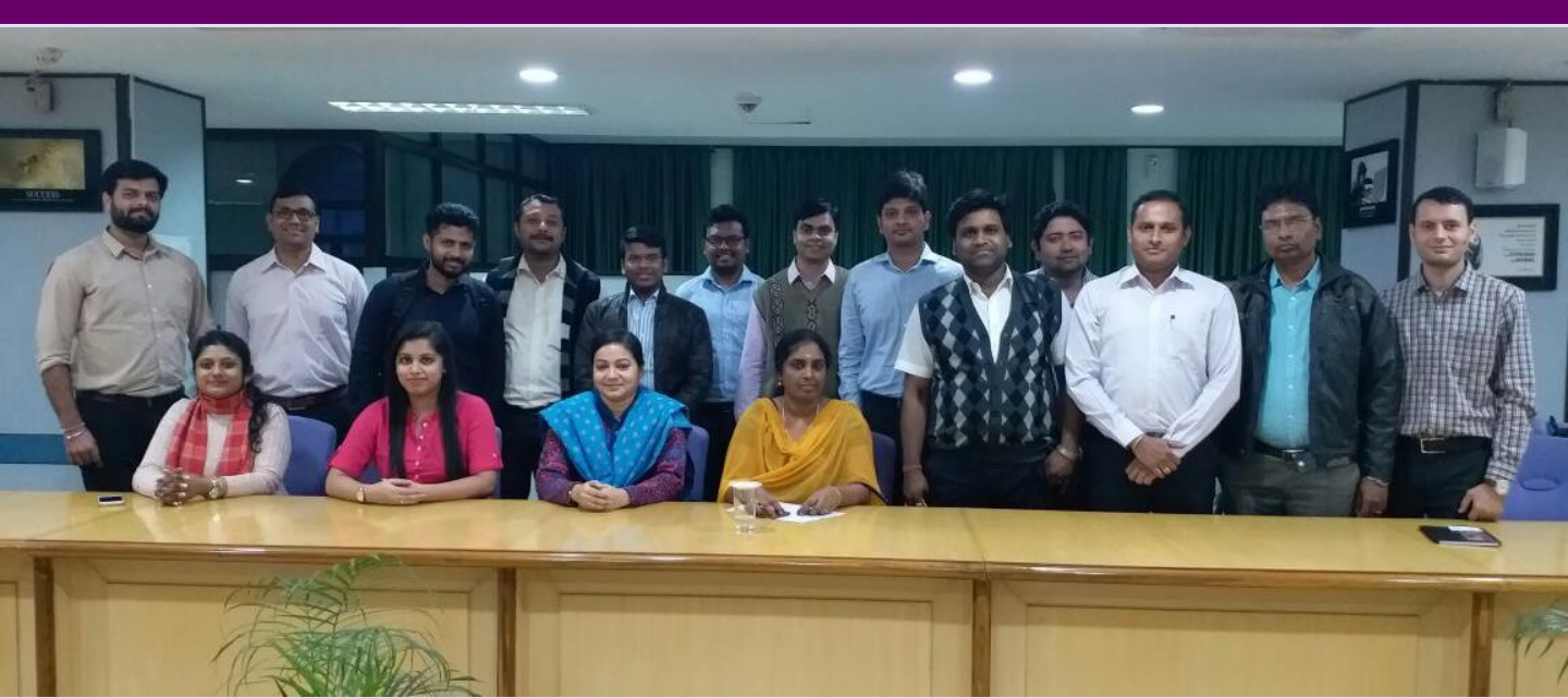
An induction training program was conducted for fourteen lateral hire Executives, who joined the services of the company between May and December 2017. The program which was organised from 2 nd to 4 th January 2018 was very well received.