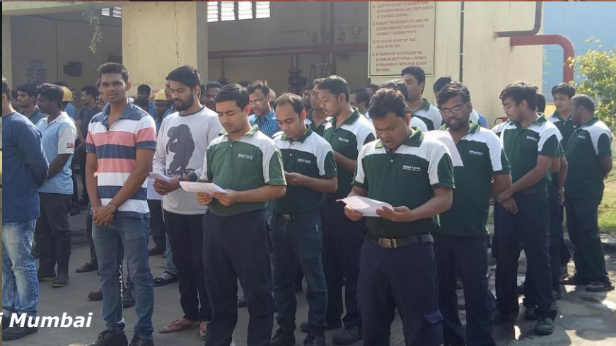
IP, Navi Mumbai