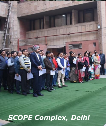
SCOPE Complex, Delhi