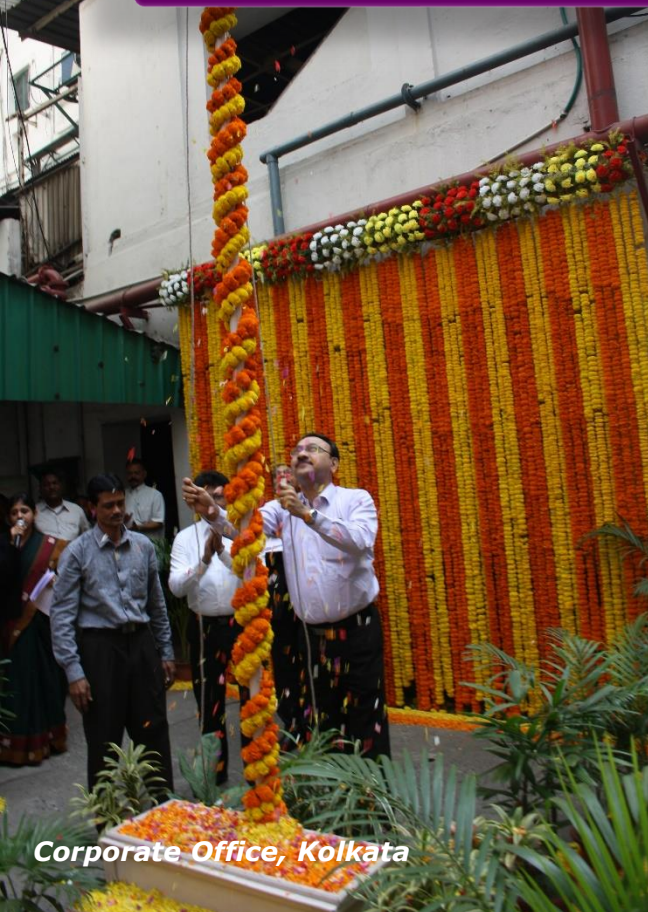
Corporate Office, Kolkata