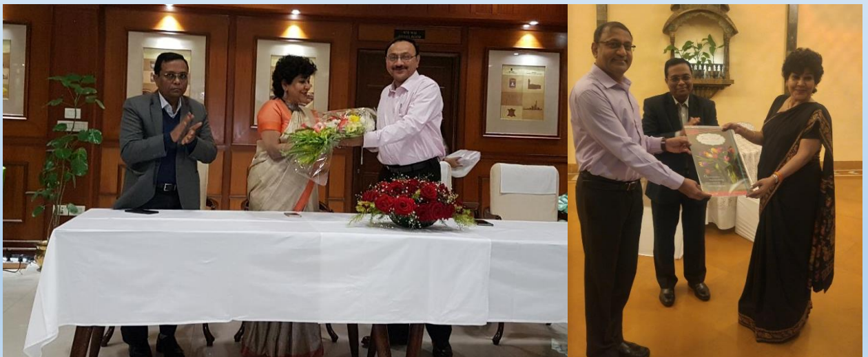
(L) C&MD felicitates D[HR&CA] during the farewell function at the Corporate Office, Kolkata; (R) D[S] hands over a greeting card to D[HR&CA] during the farewell function organised by the Top Management team