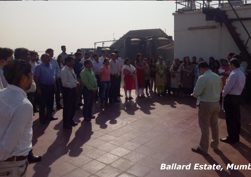
Ballard Estate, Mumbai