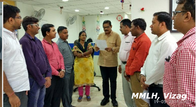
MMLH, Vizag 19-05-2017