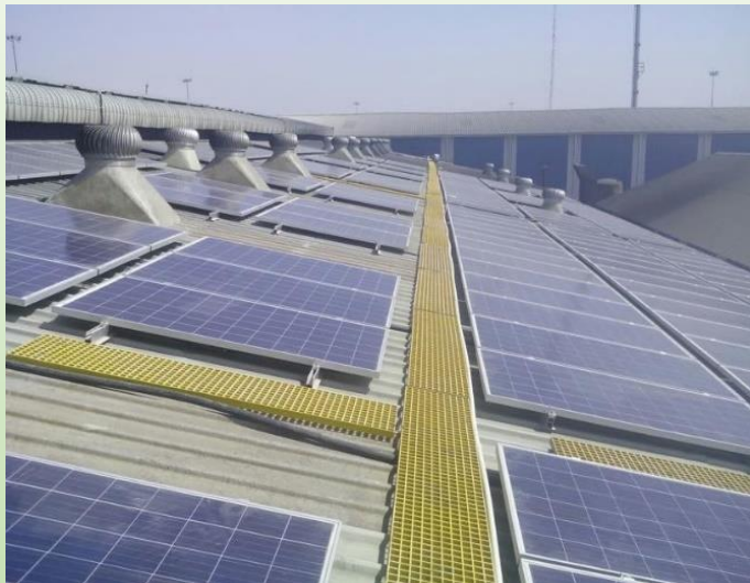
100 KWp roof top solar plant at Asaoti