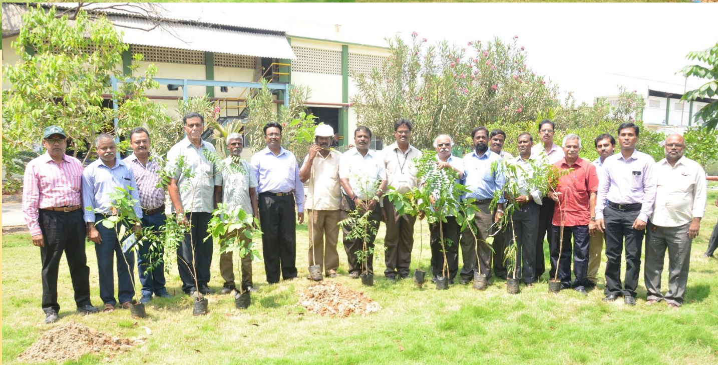
In the Manali Industrial Complex at Chennai, birthdays of employees are being celebrated with a difference. In the last working day of the month, all the employees who had birthdays during the month cut a cake and then plant a tree in the factory complex. The respective employees have to take care of the sapling planted by them. Chocolates are distributed during the function. This initiative, which was taken post the Vardah effect in Chennai, will help to regain the trees that were lost due to the cyclone.