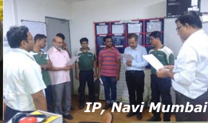
IP, Navi Mumbai