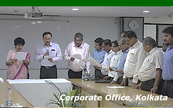
Corporate Office, Kolkata