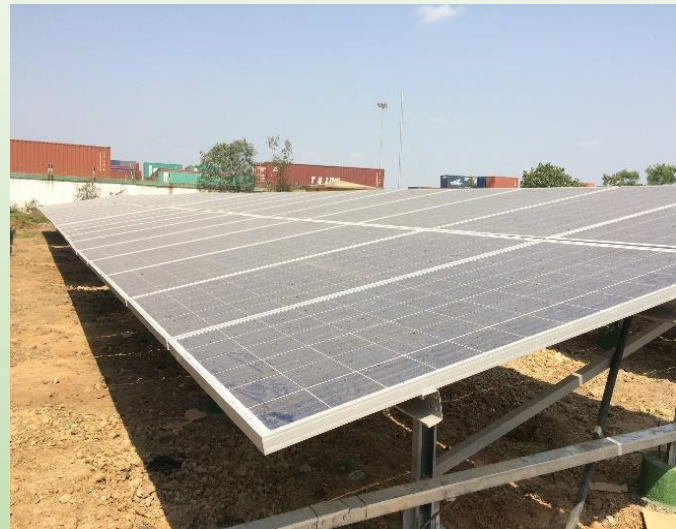
200 KWp solar plant at Manali, Chennai

Balmer Lawrie is committed towards sustainable development and is consciously working towards developing a green supply chain. As a part of this initiative, our company has installed 300 KWp of solar plant in 2016-17. A 100 KWp of roof top plant has been installed at the Industrial Packaging plant in Asaoti and 200 KWp of solar plant has been installed at the Manali Complex in Chennai. Each month, the plants are capable of generating 13500 KWh and 27000 KWh of power respectively and will help us to offset 450 tons of carbon dioxide each year.