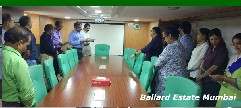
Ballard Estate Mumbai