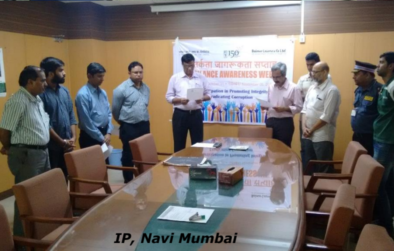
IP, Navi Mumbai