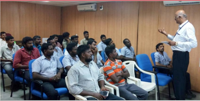
A training program on 5S, housekeeping and general health awareness was organized for contract workmen in Chennai on 1 st October 2016.