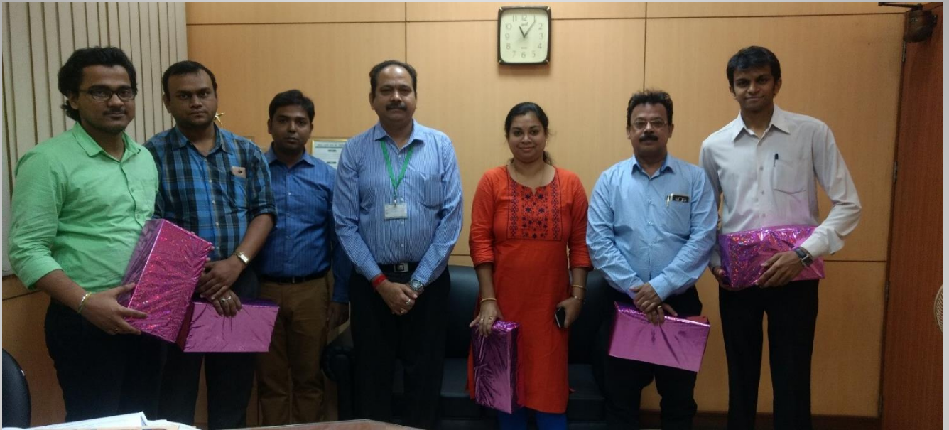
An Online Quiz Contest was held during the Centenary Birth Anniversary of Pandit Deendayal Upadhyay. Winners of the Online Quiz Contest are as follows: