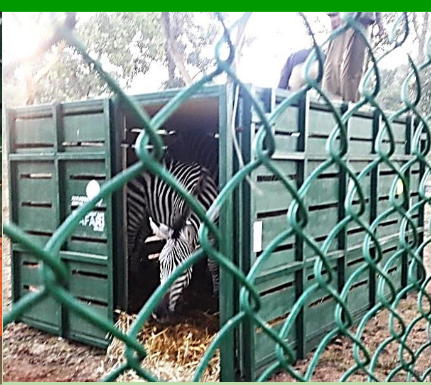
Logistics, Bangalore successfully handled the Customs clearance for the import of four zebras, as part of an exchange program, from Israel to the Bannerghatta National Park, Bangalore on 26 th November 2015. The zebras were brought to Bangalore by Lufthansa.