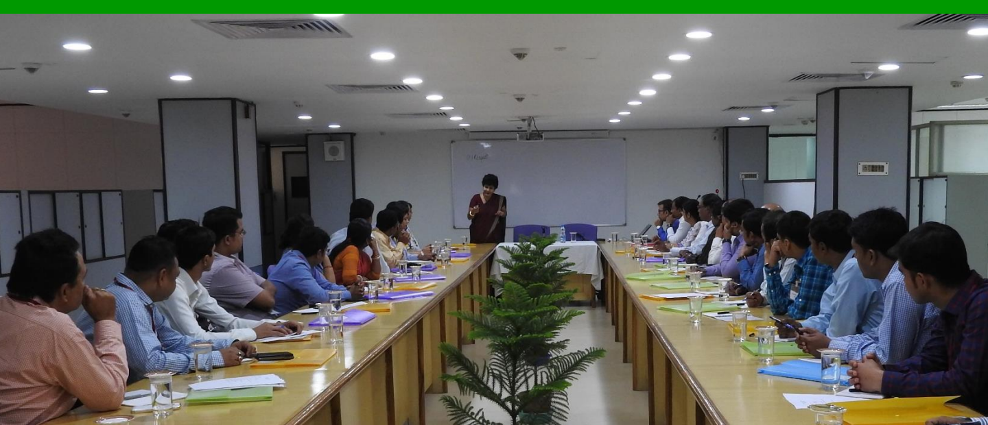
The session at Kolkata was held on 24 th November at the BL Training Centre