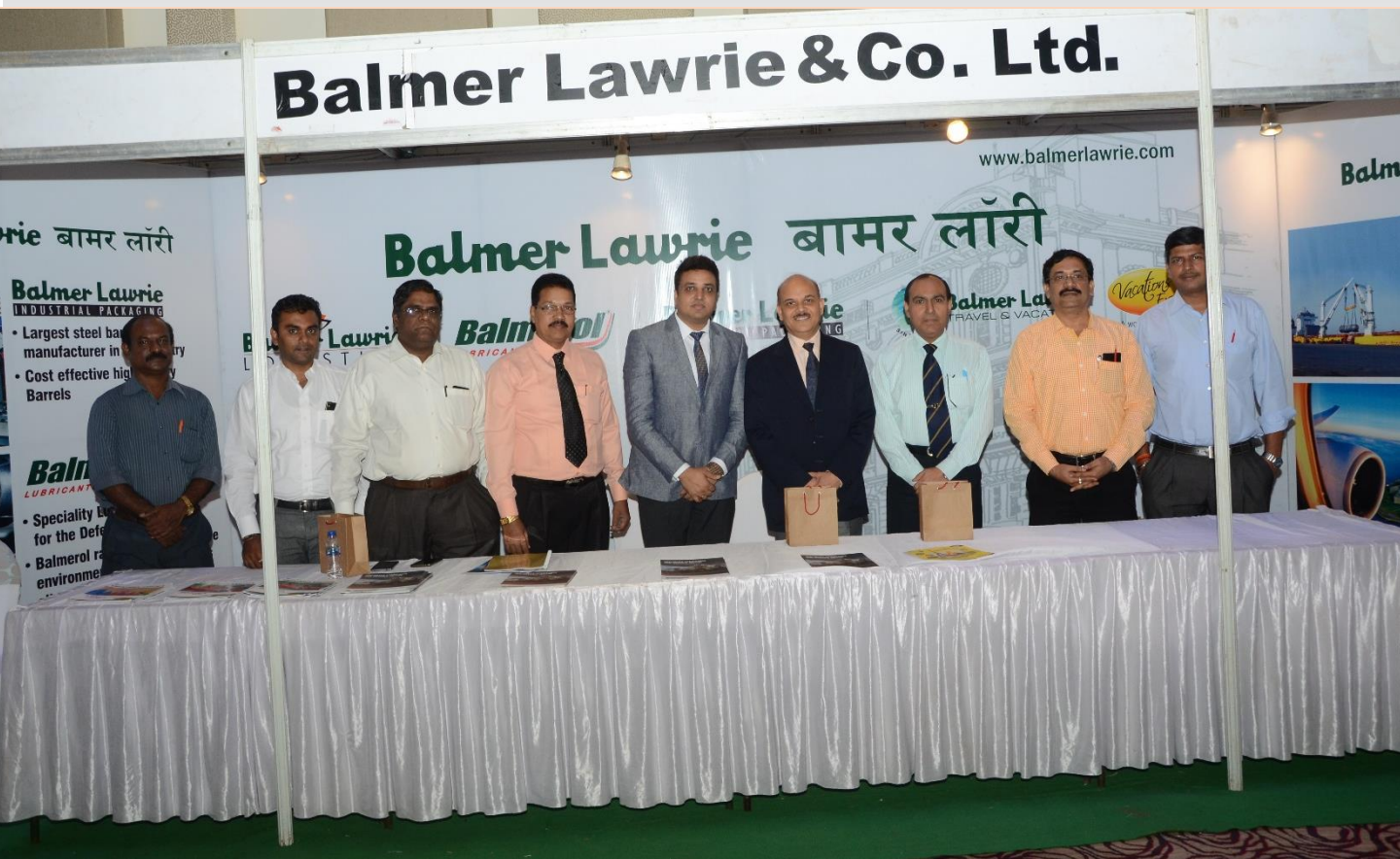
Balmer Lawrie (BL) was a gold sponsor of Industry Defence Linkage organized by CII on 3 rd November 2015 at The Gateway Hotel, Raipur. SBUs: G&L, IP, Logistics and T&V represented BL at the event.