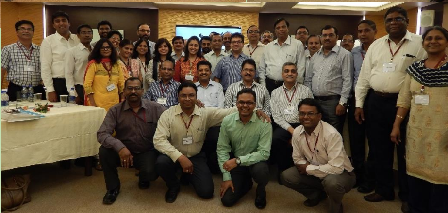
The sessions in Mumbai were held from 18 th to 20 th November