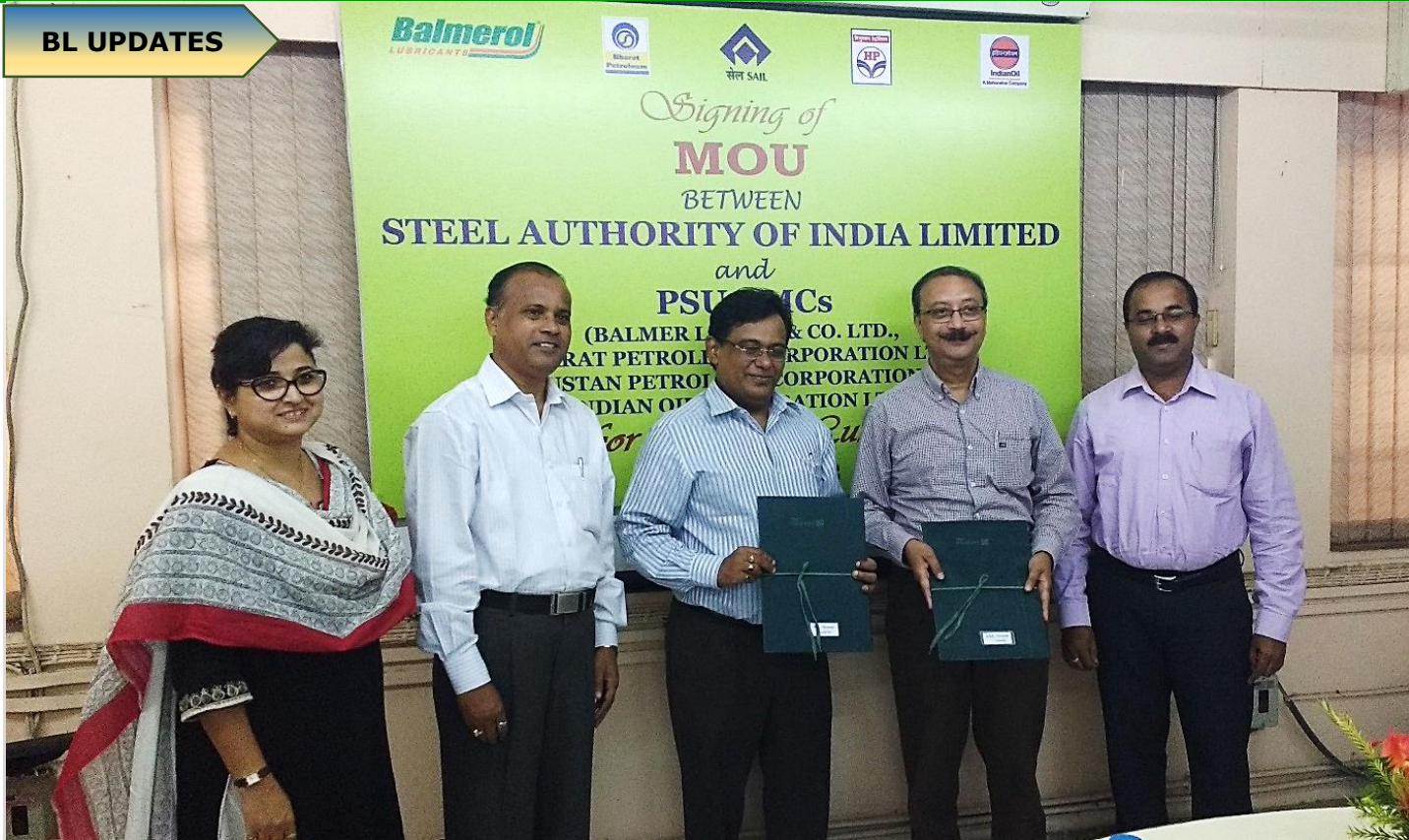
An MOU was signed between SAIL and Balmer Lawrie on 17 th November 2015 at the Durgapur Steel Plant, for supply of lubricants to all the SAIL Plants for a period of three years.