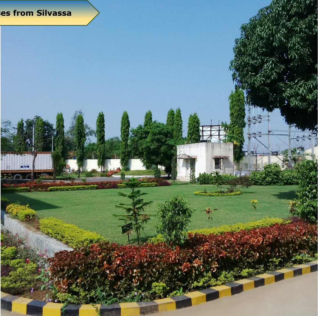
Balmer Lawrie G&L Plant at Silvassa