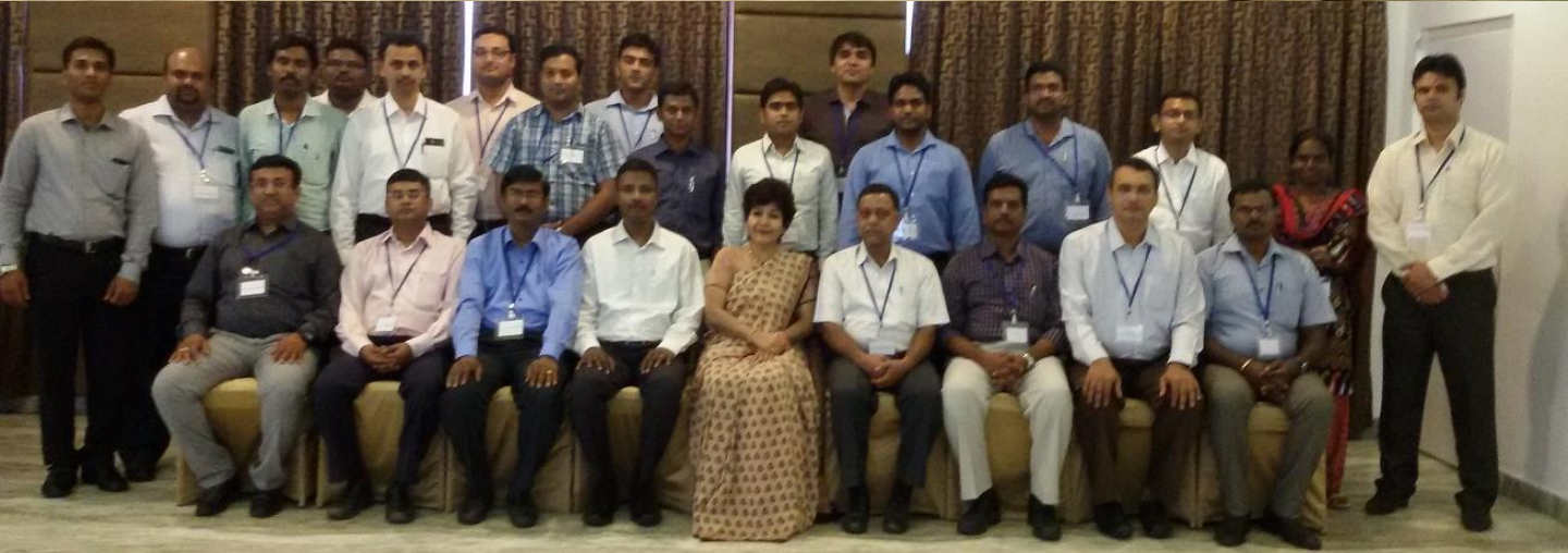
The sessions in Chennai were held on 2 nd and 3 rd November