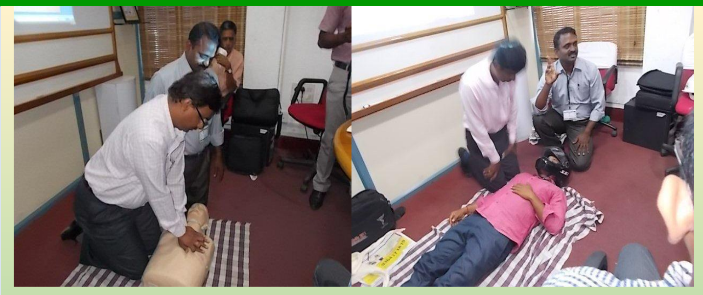
First Aid Training at CFS, Chennai