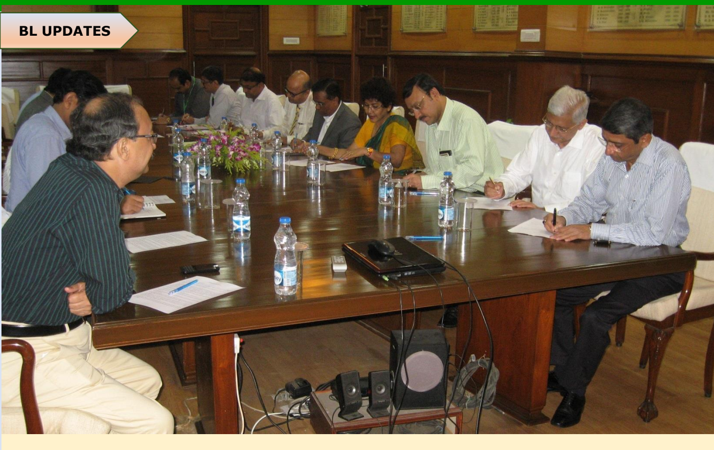
A confidentiality agreement was signed by the Top Management Team on 30<sup>th</sup> July in the Board Room at the Corporate Office in Kolkata.