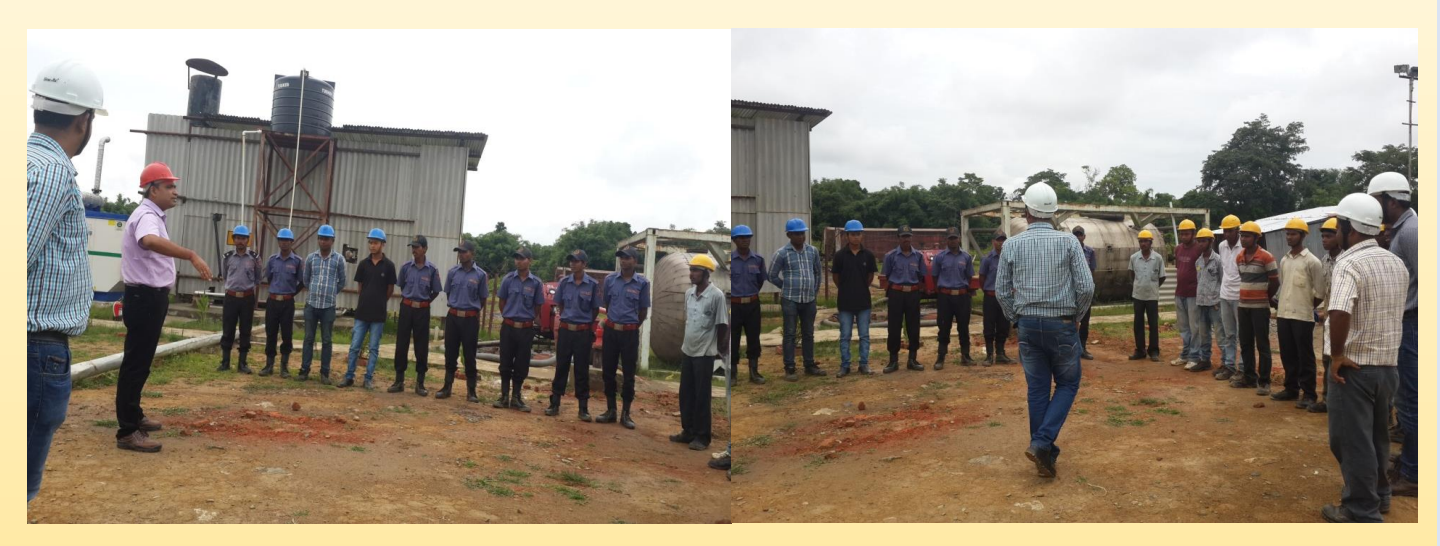
HSE Training on Safety Dos & Don'ts at ROFS Dicom Site

Not all risks can be engineered out of the work environment. Even with the best plans, procedures and systems in place, individuals at work still take short cuts and make mistakes. Sometimes risk-taking behaviours are intentional, for whatever reason. In other cases, risks may be taken due to a lack of understanding about a particular hazard, associated controls or inadequate training. Continuous safety related training is very vital to make people aware and remind them of particular hazards and controls. In July 2015 various safety training programs were organized across SBUs.