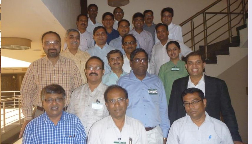
A three day learning workshop titled "Train the Trainers" was organised for Executives at Spring Club, Kolkata from 16 th to 18 th October 2014. The workshop was inaugurated by C&MD and the session was conducted by a Senior Training Consultant from Dale Carnegie Training India.