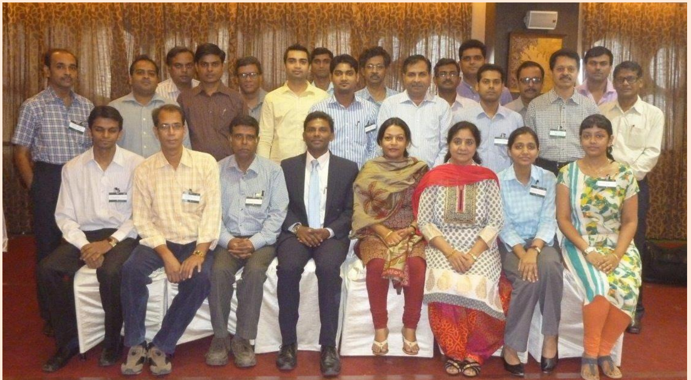
A training program on "Communicating with Impact" was organised at Spring Club, Kolkata on 17 th and 18 th October. In photo are the participants along with the trainer from Dale Carnegie Training India.